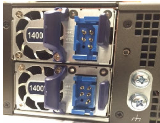
FIGURE 1 DC PSU