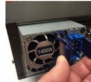
FIGURE 3 Unlocking the PSU